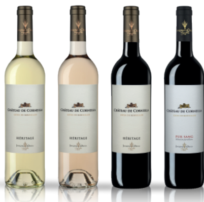
CHÂTEAU DE CORNEILLA CLASSIC RANGE