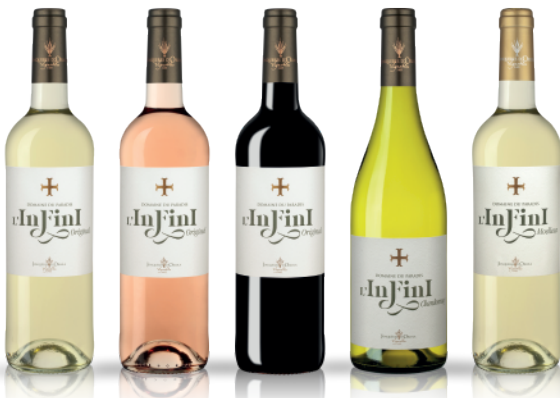
DOMAINE DU PARADIS INFINI RANGE

Temperature of service : 10°C Keeping : 3 years – to enjoy in its youth